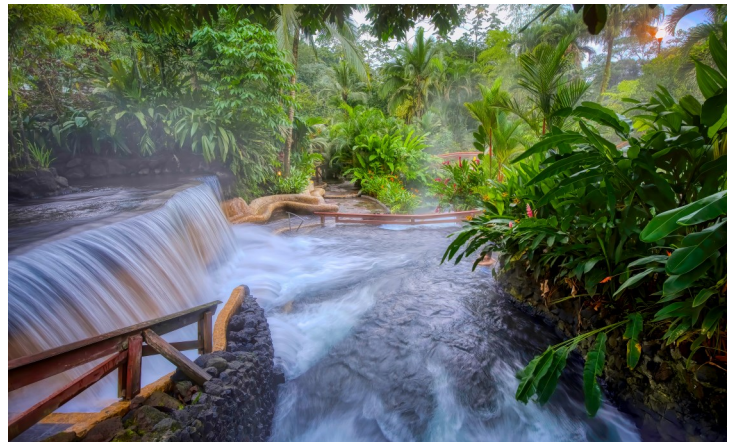
Unwind in La Fortuna's natural hot springs