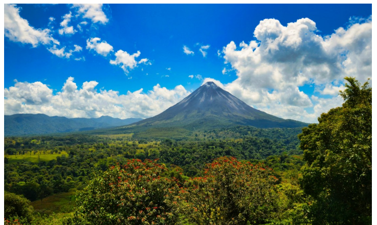
The magnificent Arenal Volcano