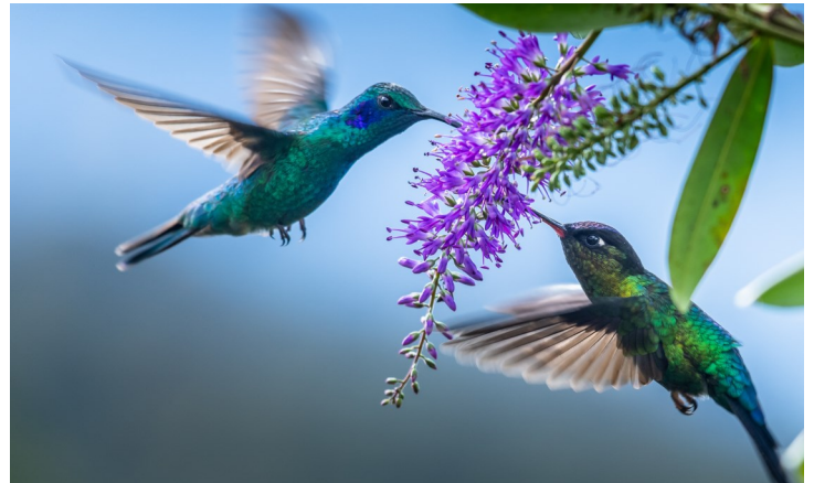
With over 900 bird species, Costa Rica is a paradise for bird lovers