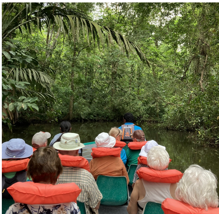
Craig Travellers exploring Tortuguero National Park.