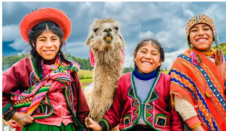
Warm welcoming smiles in Peru