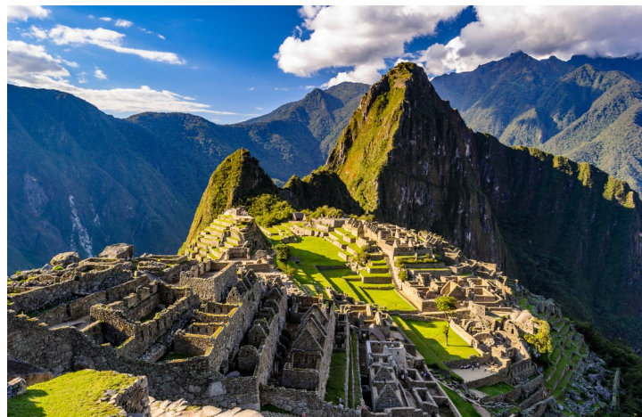
Get lost in the magic of Machu Picchu