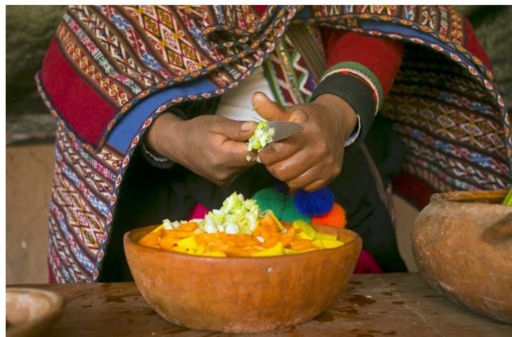
Sacred Valley, Preparing for a traditional Andean soup