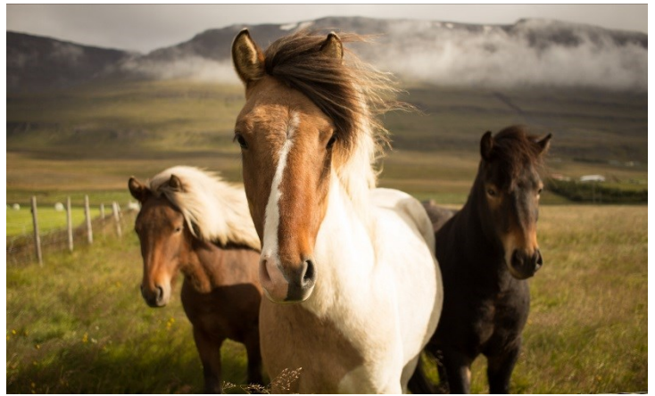
Indigenous horses of Iceland

An exhilarating cruise exploring the natural paradise of Breiðafjörður awaits in the charming village of Stykkishólmur. Relax and take in the spectacular island scenery and dramatic tidal flows, teeming with a variety of bird life, including puffins, eider ducks, kittiwakes, fulmars, and the white-tailed eagle. Along the north coast, we visit remote fishing enclaves and observe the towing of a dredge along the ocean floor, scooping up shellfish delicacies that we have the opportunity to sample. Our journey continues around the Snæfellsnes Peninsula. As we round its tip, with the icecap and volcano towering above, we pass Arnarstapi, a region of striking columnar basalt formations shaped by the pounding waves. We then drive through barren lava fields, past fertile farmlands, and by the Eldborg crater, en route back to our hotel. BD