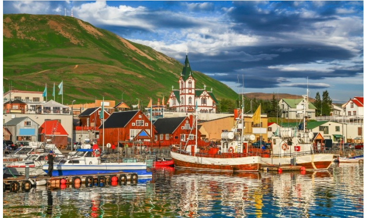
The beautiful town of Husavik

Today, we head to the charming village of Húsavík to embark on a whale watching cruise with chances to see humpback whales and thousands of puffins aboard traditional Icelandic oak boats. After lunch, we drive along the picturesque coastline of the Tjornes Peninsula to Ásbyrgi, a horseshoe-shaped gorge believed to be the hoof print of Odin's eight-legged horse, Sleipnir. This evening, there may also be an opportunity to enjoy a local hot spring. BD