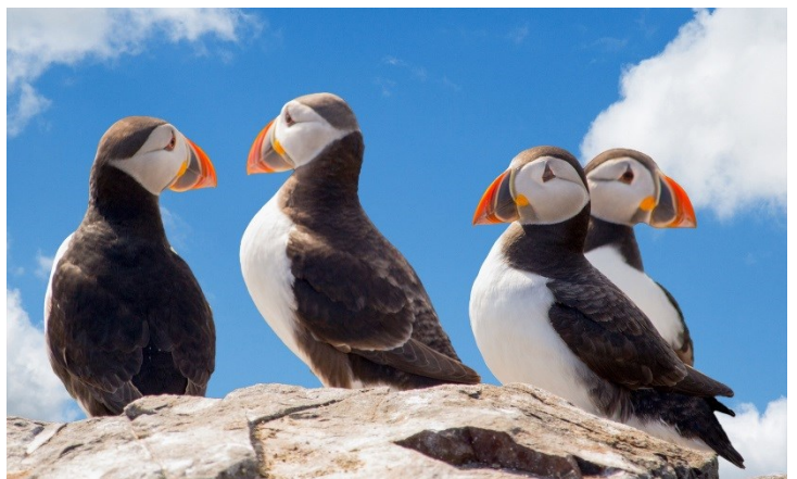
Observe puffins in their natural environment

Journey south through the sheltered eastern fjords, past small fishing villages like Reyðarfjörður and Fáskrúðsfjörður, stopping for brilliant photo opportunities. We shall visit Stöðvarfjörður village, where we will see the famous stone collection of Petra before continuing to