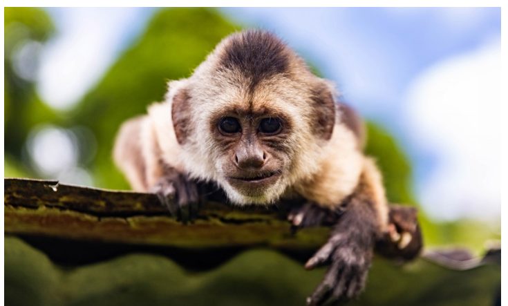
A curious capuchin monkey