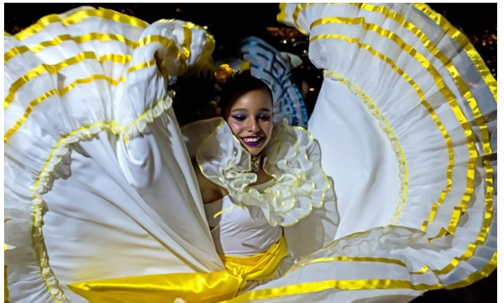
Traditional costume and dance of Costa Rica.