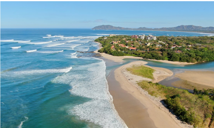
Relaxing by the beach in Tamarindo

All too soon, our unforgettable Costa Rican adventure comes to a close as we transfer to the airport for our journey back to Canada. B