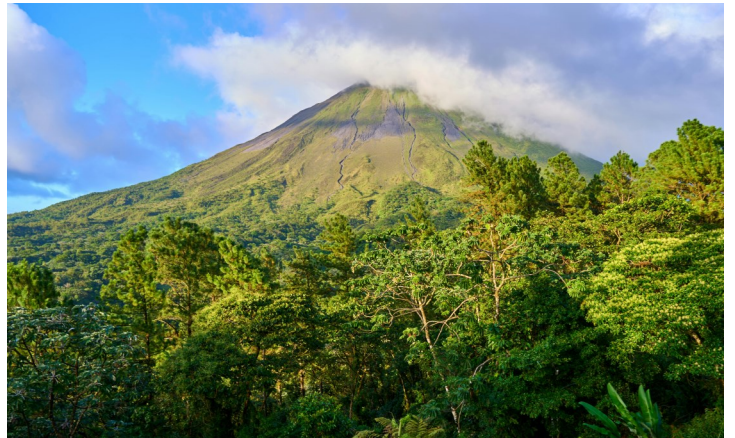
The magnificent Arenal Volcano