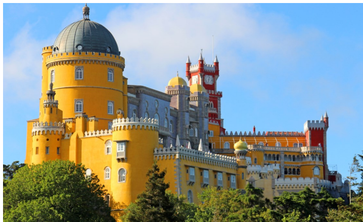
The Pena National Palace, Sintra

MAY 15, Friday PORTO Today we are back in the vibrant city of Porto at the mouth of the Douro river. Famous for its export of Port wines, it's easy to imagine how British merchant ships would have once clustered together in the medieval harbour, waiting to take their produce across the water. Our city tour will touch on the fortified structures of Castelo da Foz and Castelo do Queijo. Those willing can join a walking tour through town to get closer to the vibrant daily lives of the locals. BLD