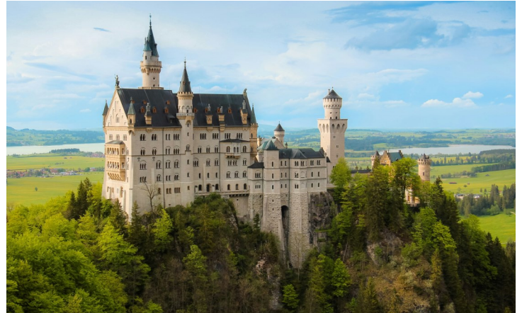
The grand Neuschwanstein Castle

In the morning we board our boat and sail across the crystal clear waters of Lake Königssee to visit the church St. Bartholomew, located at the foot of Mount Watzmann. After 1810, St. Bartholomew became one of the favourite places for Bavarian kings. From here, we enjoy some free time to explore the various walking trails that dip into the National Park. Afterwards, we continue to Berchtesgaden and visit a salt mine before returning to our hotel. BD