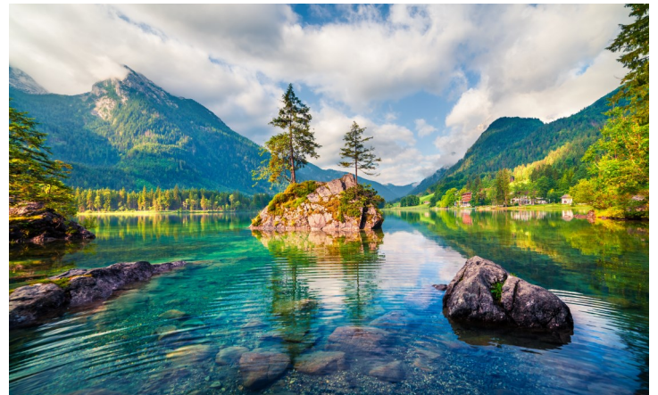
Clear waters of Lake Hintersee

We start our day with a visit to Ettal Monastery where we can catch glimpses of the lives of the Benedictine monks residing here. Dating from 1330, the building has been maintained and restored through the dedication and hard work of the residents and, at times, the knights. After that, we will explore one of King Ludwig II's dreamy castles, the Linderhof Palace. We discover King Ludwig's safe haven within the mountains before we take a leisurely walk for 1.5 hours (about 5 km) to Graswang where we meet our bus for the return journey to Oberammergau, alternatively, opt for a scenic 6km walk back. BD