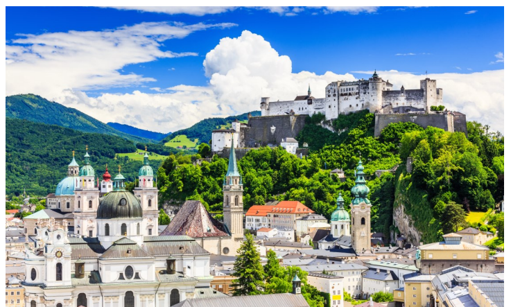
Discover the timeless charm of Salzburg

Our hike this morning brings north along the Ammer River to Unterammergau. We walk through the Pulvermoos nature reserve. On a slight incline, we walk along Romanshöhe to Christuskreuz, which offers a magnificent view over the Ammer Valley. We stop at the mountain lodge Romanshöhe for a picnic lunch. In the afternoon continue along Gregorichapel back to Oberammergau. (11 km, 4 hours, easy hike, 143 m elevation change) BLD