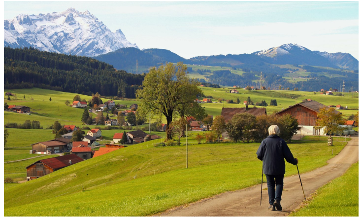
Bask in the beauty of the Austrian Alps

Today we will venture into the Bavarian Mountains to the Berchtesgaden area. On our first hike, we will walk through an enchanted forest to Hintersee. The "Zauberwald" (magic forest) is a pristine mountain forest. Created by a dramatic rockfall thousands of years ago, nature has formed a wild, romantic landscape with huge boulders. Our bus will pick us up at the quaint village of Ramsau and bring us to the Obersalzberg. Afterwards, we take the shuttle bus up to the peak, the "Eagle's Nest". Located at an elevation of 1,834 m, on a clear day the "Eagle's Nest" offers a magnificent view across the Bavarian Mountains and the Salzburg Alps. From the bus drop off you have the chance to either take the elevator for the last 124 metres of elevation change, or you can walk a short panoramic way up which takes about half an hour. Of course, you can take the way down as well instead. In the afternoon we head back to Salzburg for dinner and overnight. (6.4 km, 2 hours, easy hike, 120 m elevation change) BD