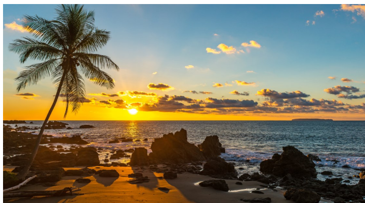
A stunning sunset in Tamarindo Beach

To reserve your spot on this tour, you can either book online through our website or submit an enrollment form along with your deposit to: