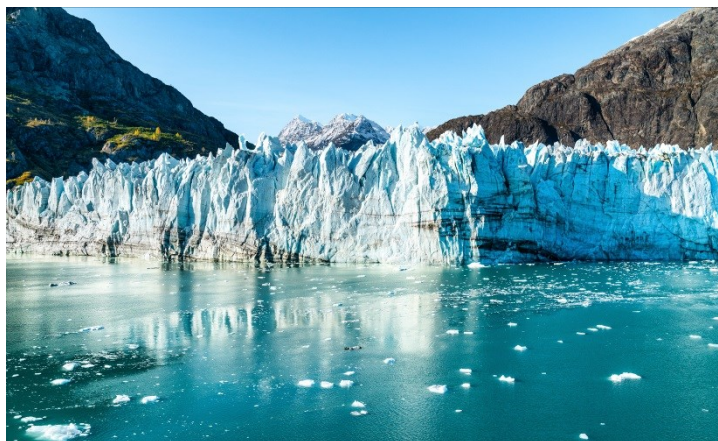
Stunning Glacier Bay