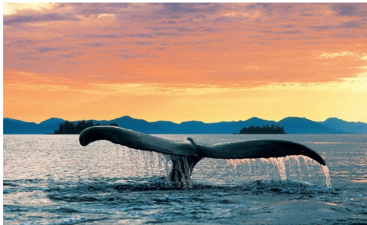
Keep an eye out for majestic whales.