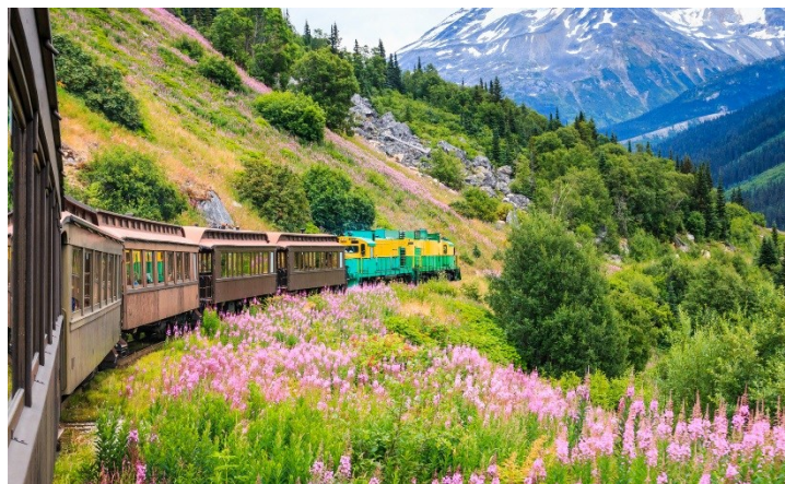
Embark on the White Pass and Yukon Railway to retrace the Trail of '98