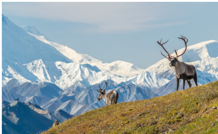
Alaskan Caribou in the sweeping wilderness

Today enjoy exploring this delightfully restored frontier town, complete with its boardwalk and authentic shops from a bygone era. We say farewell to our Yukon guide as we embark on the ms Zaandam , our floating home for the next four nights. Embark / Sail 9:00pm BD