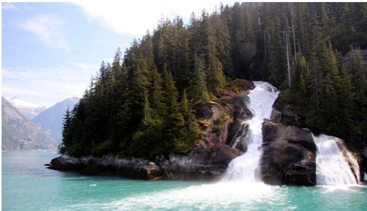
Witness the magnificent fjords.

For peace of mind, your deposit for this journey is fully refundable until: May 5, 2025