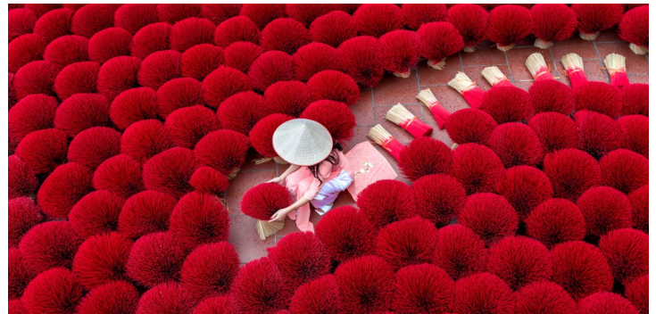
Drying colourful incense, Hanoi

NOV 21, Friday SIEM REAP This morning we visit Angkor Thom, the last capital of the Khmers. We shall see the Elephant and Leper King Terraces together with the stunning Bayon Temple, with its extensive and detailed relief carvings, and the Baphuon. Our next stop is Ta Prohm, a temple site reclaimed by the jungle and only recently rediscovered. This afternoon explore the world's largest temple, Angkor Wat. With the volume of stone equaling that of the pyramids in Egypt, this temple took thirty years to complete and has been occupied by Buddhist Monks ever since. Of special note are the bas-reliefs on the exterior walls. Then, we visit a school dedicated to teaching traditional arts, stone and wood carving, lacquerware and more. BLD