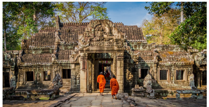
Buddhist monks at Angkor Wat

NOV 23, Sunday SIEM REAP / EMBARK This morning we transfer by coach to Steung Trang to embark on our ship and new home for the next week. Enjoy lunch onboard, and set sail this evening on the Mekong. RV Mekong Pandaw (7 nights) BLD