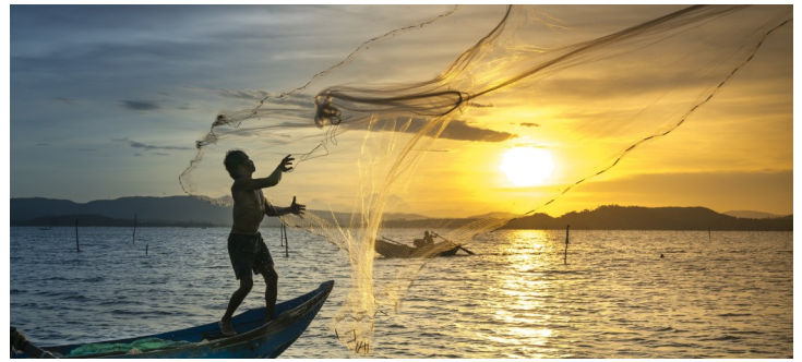
Fishermen on the banks of the Mekong River

NOV 19, Wednesday HANOI / HA LONG BAY We drive to Vietnam's Ha Long Bay and board Paradise Elegance for a cruise amongst this UNESCO World Heritage Site known for its magnificent natural beauty. On board, we will enjoy a seafood lunch and cruise through the islands as we explore a series of breathtaking caves and grottoes. Paradise Elegance (1 night) BLD