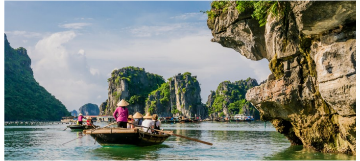
Cruise amongst UNESCO World Heritage Site Ha Long Bay

NOV 20, Thursday HA LONG BAY / HANOI / SIEM REAP, Cambodia We disembark and make our way back to Hanoi, with lunch at a local restaurant en route, to board our flight to Seam Reap. Upon arrival we transfer to our hotel. Borei Angkor Resort and Spa (3 nights) BLD