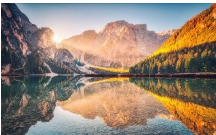
The serene beauty of Lake Braies