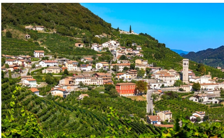
Conegliano, the heart of Italy's Prosecco region