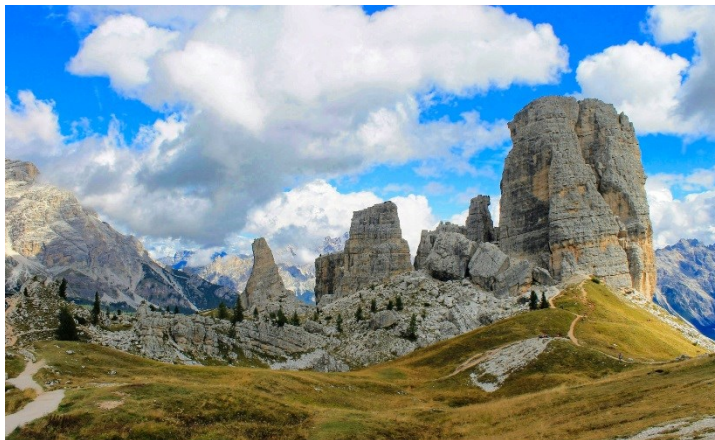
The iconic Cinque Torri