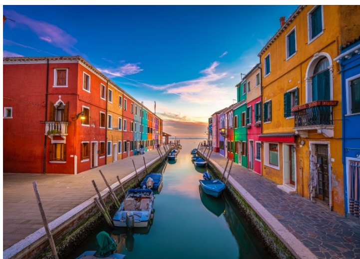
Colourful Burano island at sunset