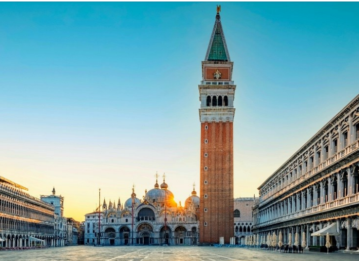
The historic St. Mark's Square

CT Rating 4.5/5 - Extremely Challenging: This journey involves a number of hikes ranging from easy to difficult on hilly/uneven surfaces, lasting up to 2 - 5 hours per day. Listed hiking distances, elevation changes, and times are estimates and refer to the total hiking time for each full day. Travellers must be in excellent physical condition and be able to maintain the group pace. Alternate activities may be available for those unable to complete some of the hikes. Depending on weather and location conditions, daily activities may have to be altered or adjusted. Accommodations will be in comfortable traditional European hotels with atmosphere and character. Trail conditions may vary and are subject to change.