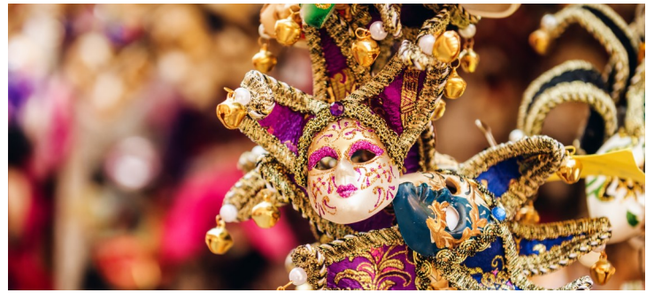
Intricate Venetian masks

CT Rating 4.5/5 - Extremely Challenging: This journey involves a number of hikes ranging from easy to difficult on hilly/uneven surfaces, lasting up to 2 - 5 hours per day. Listed hiking distances, elevation changes, and times are estimates and refer to the total hiking time for each full day. Travellers must be in excellent physical condition and be able to maintain the group pace. Alternate activities may be available for those unable to complete some of the hikes. Depending on weather and location conditions, daily activities may have to be altered or adjusted. Accommodations will be in comfortable traditional European hotels with atmosphere and character. Trail conditions may vary and are subject to change.