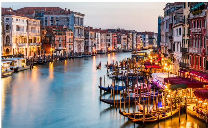
Venice's Grand Canal aglow with evening charm

This morning we visit the north side of the Fanes-Sennes-Braies Nature Park and the picturesque Lake Braies. Our leisurely walk will loop around what is arguably one of the Dolomites’ most beautiful lakes, with mountain peaks