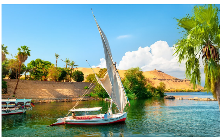
Sail on a felucca along the Nile