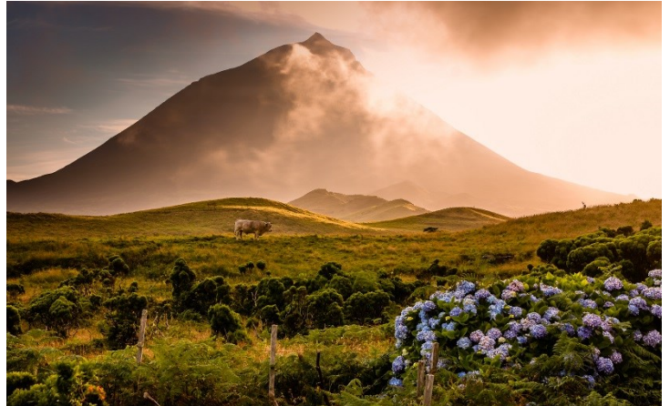
Mount Pico, the highest peak in the Azores