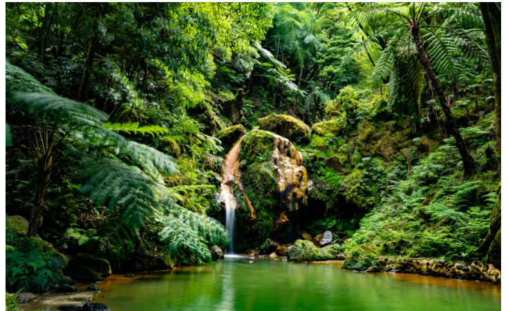
São Miguel's thermal pools offer pure relaxation

A morning flight brings us to São Miguel, the largest and most geographically diverse of the islands. We start our exploration on the western side, with Sete Cidades, which is renowned for its scenic mountains and lakes. Along the way, take in coastal views, lush pastures, and charming cattle farms. Stop to visit a pineapple plantation and learn about its cultivation. The day concludes in the spa town of Furnas. Terra Nostra Garden Hotel (3 nights) BLD