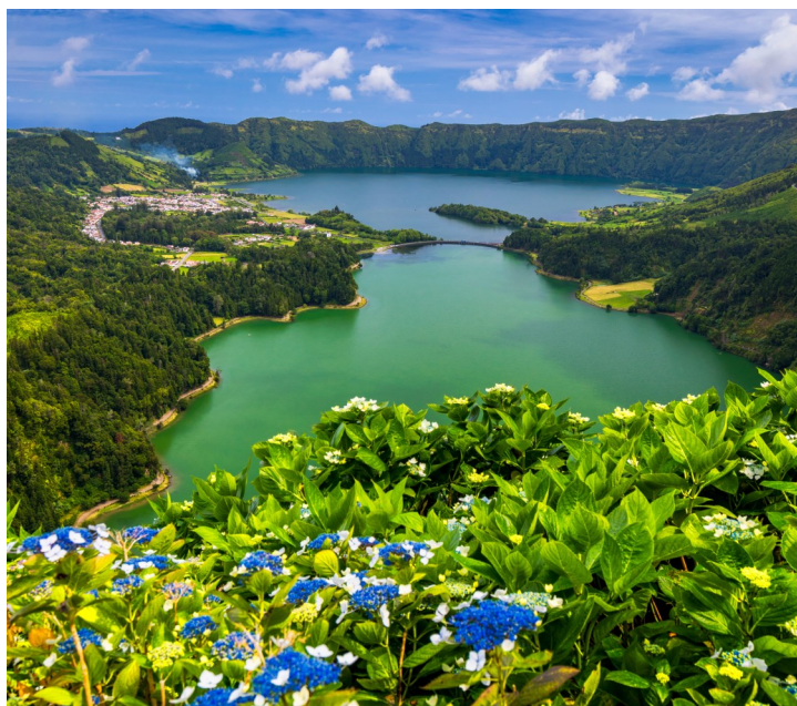
The twin lakes of Sete Cidades

SEP 24, Wednesday PONTA DELGADA / CANADA Ponta Delgada is the largest city and the capital of the Azores. While the city continues to expand, its historic centre remains well-preserved, with whitewashed buildings accented by black basalt trim. Our walking tour begins at the City Gates, a symbol of Ponta Delgada. From there, we continue to City Hall to see the ornate statue of St. Michael the Archangel, the city's patron saint. We'll also visit the Matriz Church and the Museum of Sacred Art, housed in the former Jesuit College. The tour concludes at the Convento da Esperança and the Sanctuary of Senhor Santo Cristo dos Milagres, one of the most significant religious sites in the Azores. After some free time for lunch, we'll transfer to the airport for our direct flight to Toronto, with connections across Canada. B