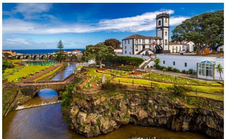
The quaint town of Horta, Faial Island