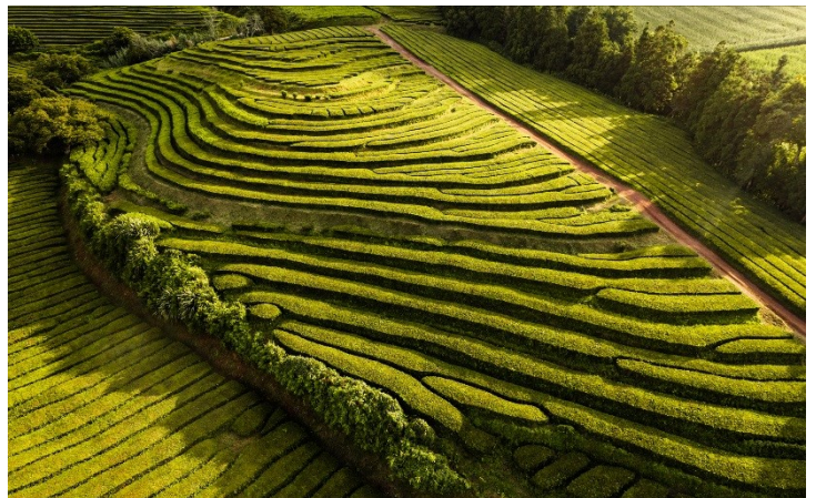
Rolling tea plantations of the Azores