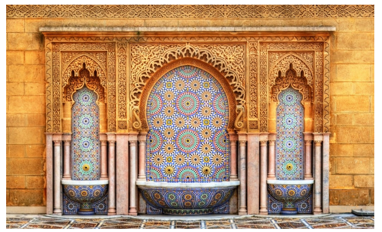
Exquisite Moroccan tiled fountains grace the cityscape of Rabat