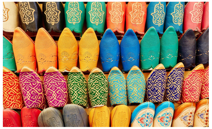
Vibrant Moroccan slippers, a colourful find amidst the bustling souks