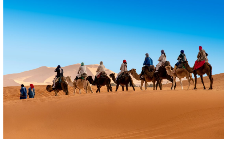
Enjoy a desert camel ride experience