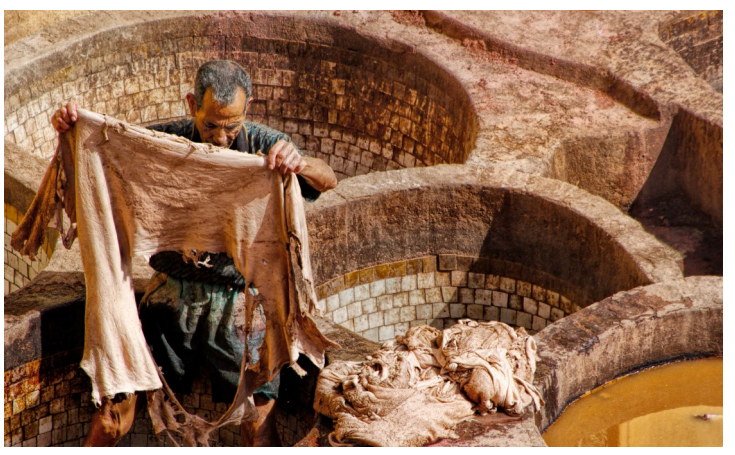
Fez's historic leather tannery: a timeless craft captured in the heart of Morocco

Today, we travel through the Dades Valley, where the Dades River nourishes a variety of colourful fruit and nut trees and extraordinary red rock formations, to reach the stunning Dades Gorge. This area is often referred to as "Kasbah Country" due to the impressive forts that grace the