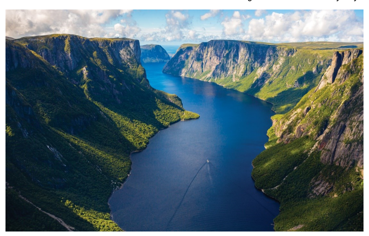
Western Brook Pond Gorge Western, Newfoundland and Labrador Tourism / MacKay Photo