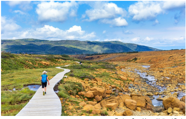
Explore Gros Morne National Park