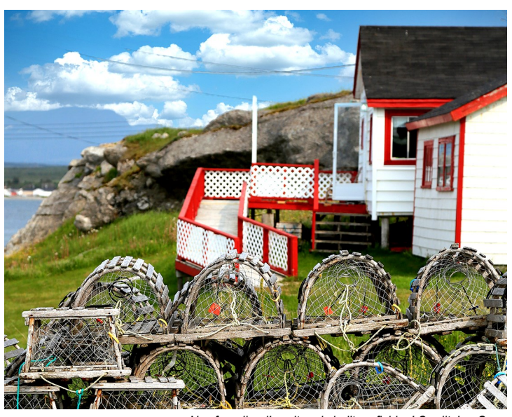
Newfoundland's culture is built on fishing!

CT Rating 3/5 - Moderately Challenging: This tour features a good deal of coach travel and visits to remote regions in Newfoundland and Labrador. There will be considerable walking over uneven surfaces. Please note that some of the hotels, while clean and comfortable, are relatively simple and rustic.