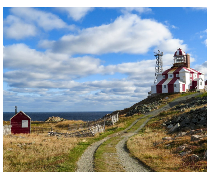
Bonavista