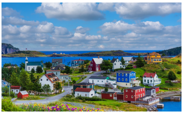
Colourful houses dotting the shoreline of Trinity Bay