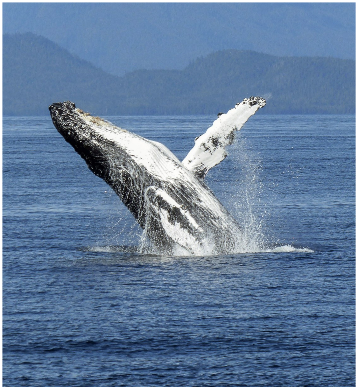
Humpback whales are the most commonly seen whales in Newfoundland

All good things must come to an end, and so we bid a fond farewell to our newest yet oldest province. As we fly homeward, we carry with us many delightful memories of an authentic Newfoundland experience that we will cherish for years to come.