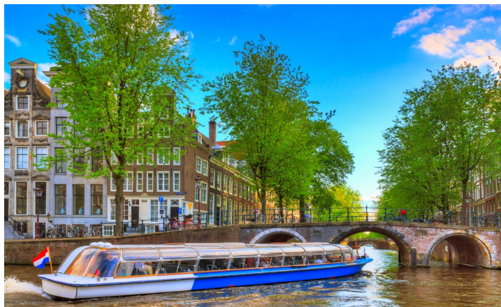
The canals of Amsterdam, Netherlands