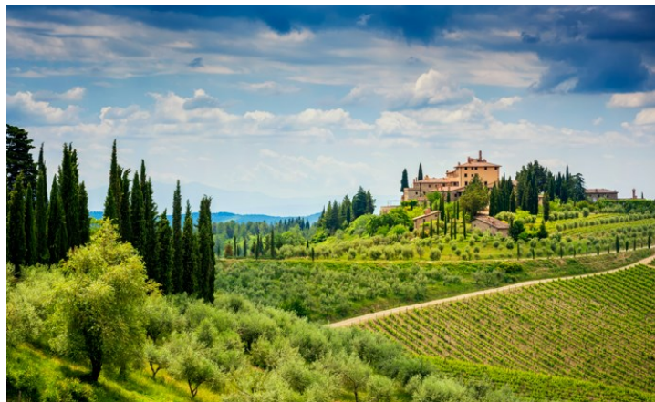
Chianti vineyards in Tuscany, Italy