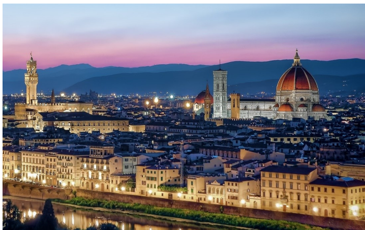
Revel in the magnificence of Florence, the cradle of the Renaissance