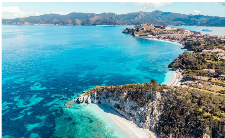
Take a ferry to explore Tuscany's most important island, Elba Island