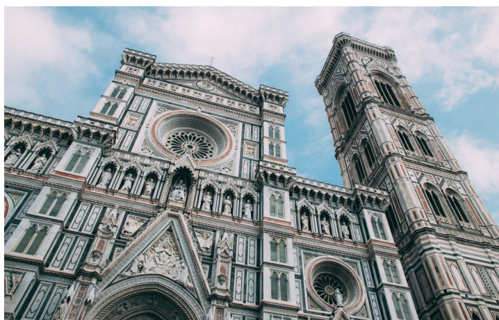
Cathedral of Santa Maria del Fiore, Florence