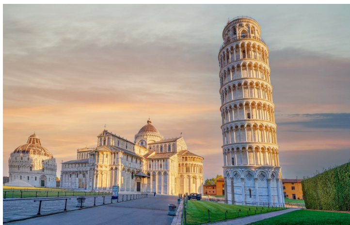
The famous Leaning Tower of Pisa

For peace of mind, your deposit for this journey is fully refundable until: June 24, 2025