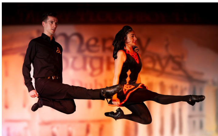
Enjoy traditional Irish entertainment at the Merry Ploughboy Pub