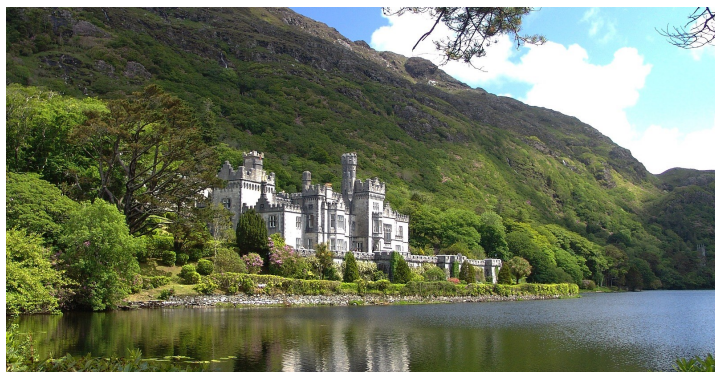
Kylemore Abbey, founded in 1920

CT Rating 3/5 - Moderately Challenging: This coach tour is designed as a leisurely, in-depth experience with two or three nights at most hotels. Members should be aware that the journey includes a number of longer walks, some over uneven terrain and with changes in elevation.