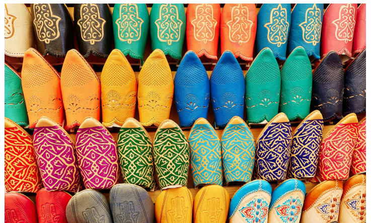
Vibrant Moroccan slippers, a colourful find amidst the bustling souks