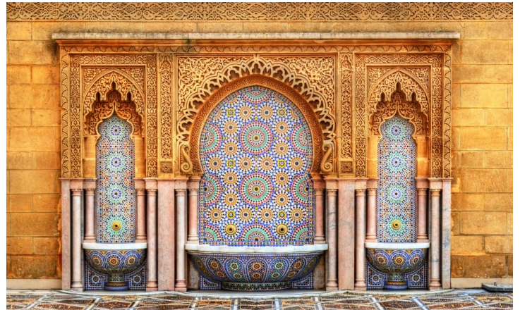
Exquisite Moroccan tiled fountains grace the cityscape of Rabat