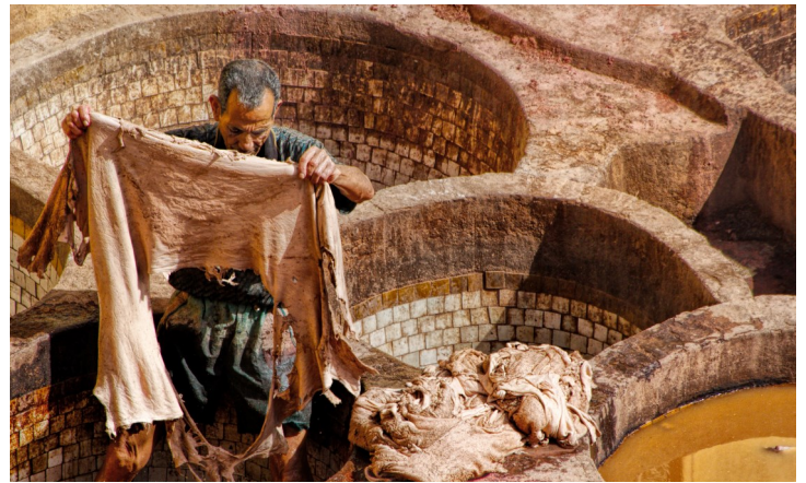
Fez's historic leather tannery: a timeless craft captured in the heart of Morocco

This is a day of enchantment as we visit the Medina of Fez, the ancient walled city of artisans, craftsmen, and lively markets. We then descend into the souks of Fez and enter yet another world filled with mingling aromas of cedar, leather, and spices, as we discover the districts of tanners, engravers, and merchants. You may want to visit the Kairaouine Mosque and University, the Bou Jeloud Gardens and the Sultan's Palace, each offering displays of classical Islamic art. BD