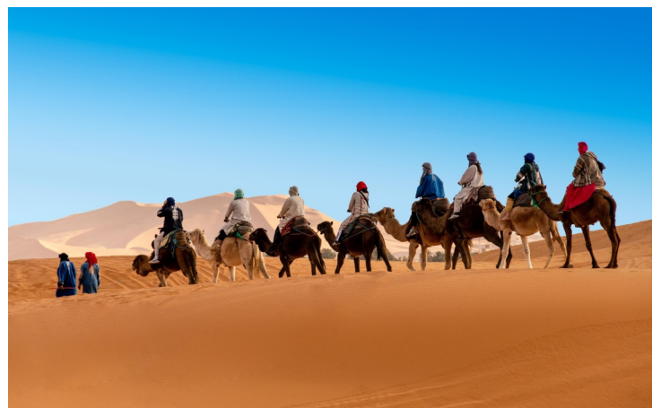
Enjoy a desert camel ride experience

Today, we travel through the Dades Valley, where the Dades River nourishes a variety of colourful fruit and nut trees and extraordinary red rock formations, to reach the stunning Dades Gorge. This area is often referred to as "Kasbah Country" due to the impressive forts that grace the