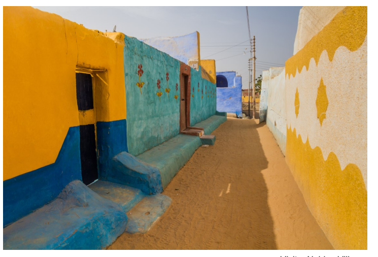
Visit a Nubian Village