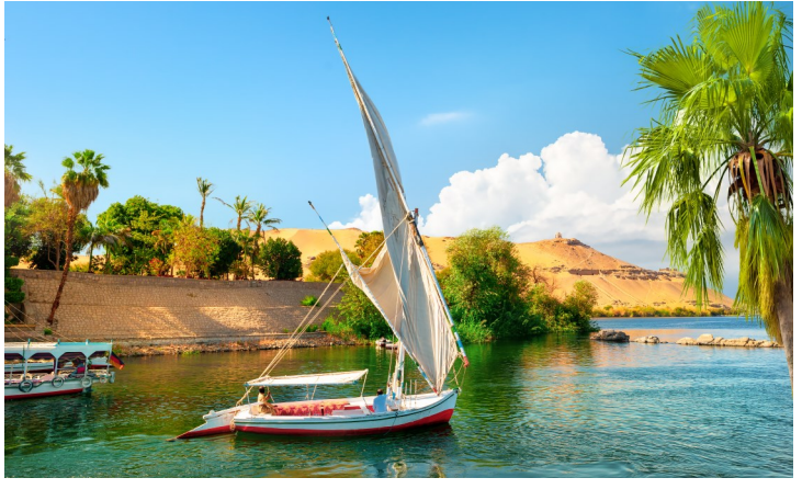
Sail on a felucca along the Nile