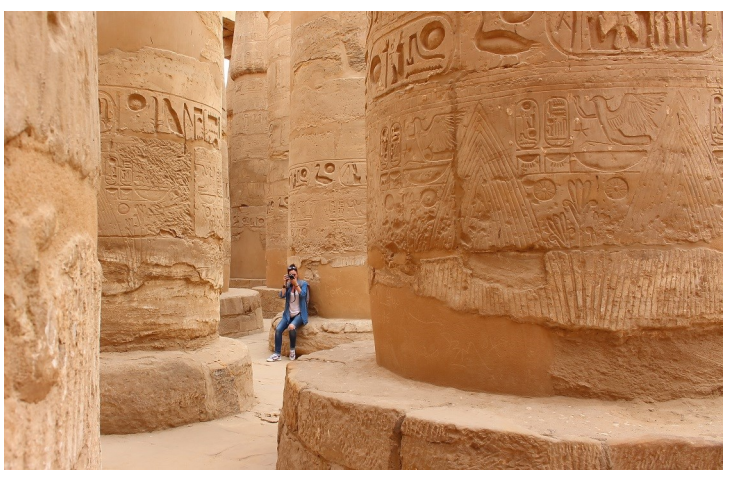
Marvel at the columns at the Karnak Temple

Cruise to Elephantine Island to visit a Nubian Village and learn about the life, history, and culture of the Nubians at the Animalia Centre. At a local school, we will interact with the students and teachers, joining a fun class to learn basic words and numbers. After walking through the village, enjoy a traditional lunch in a Nubian home. Later, cruise to