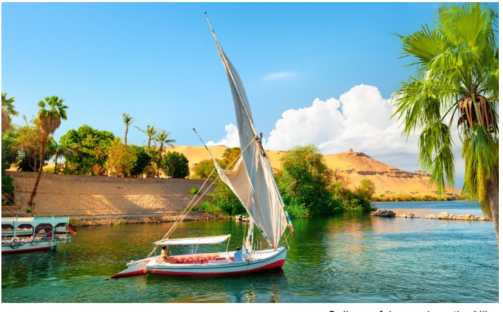
Sail on a felucca along the Nile