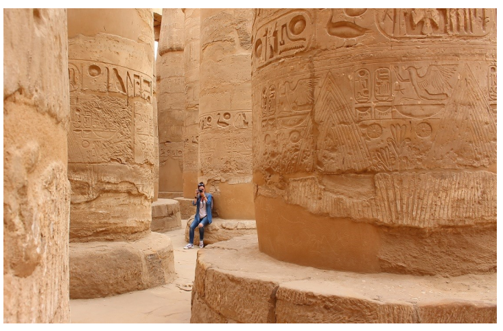
Marvel at the columns at the Karnak Temple

Cruise to Elephantine Island to visit a Nubian Village and learn about the life, history, and culture of the Nubians at the Animalia Centre. At a local school, we will interact with the students and teachers, joining a fun class to learn basic words and numbers. After walking through the village, enjoy a traditional lunch in a Nubian home. Later, cruise to