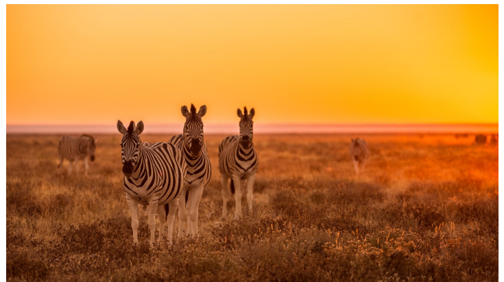
Zebra's grazing in Etosha Park, Namibia

This morning, explore some of Africa's finest prehistoric rock art at Twyfelfontein, featuring paintings and engravings dating back 5,000 years. This treasure trove, left by Stone Age artists, is one of the richest collections in Africa. Our journey through this stunning landscape includes opportunities to stretch our legs, examine interesting stones, plants, bugs, and other creatures, and photograph the amazing scenery. Visit the Organ Pipes, a mass of basalt slabs in a ravine carved by a river; Burnt Mountain, a small inselberg and national monument since 1956; and the Petrified Forest, with enormous fossilized tree trunks and welwitschia plants, reputed to live over 1,000 years. This afternoon, we'll search for desert elephant herds on an Aba-Huab River safari. BD