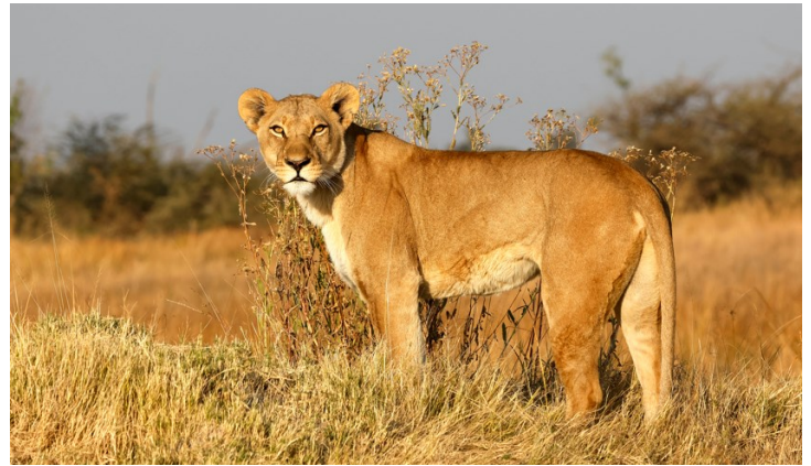
Namibia wildlife is stunning!

After breakfast, we depart in 4x4 vehicles, navigating the inhospitable terrain of the dune sea along a gravel road flanked by spectacular sand dunes. Witness the dunes' colour transformation as the sun rises. Explore the vlei, a greyish-white clay pan surrounded by towering orange sand dunes. On our return to the hotel, we'll visit Sesriem Canyon, where the Tsauchab River has exposed millions of years of geological history. Optional scenic flights over the Namib Desert can be arranged at an extra cost. BLD