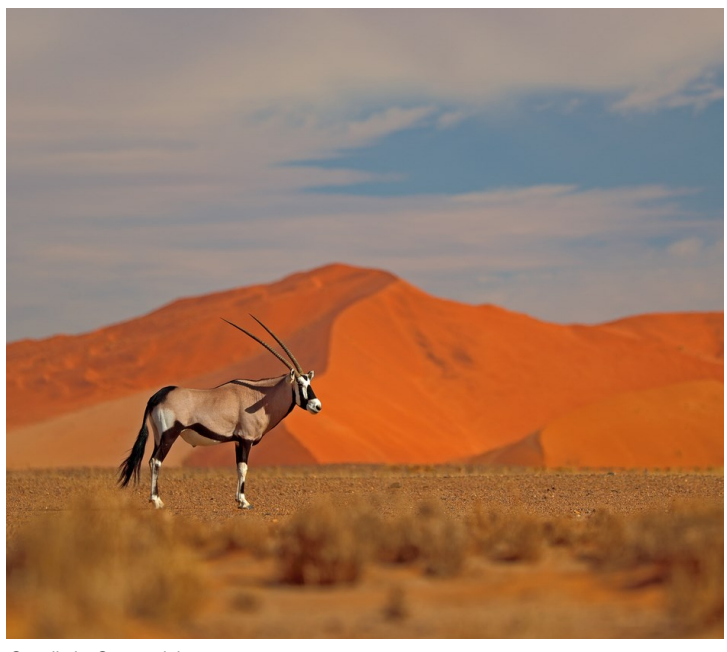
Gazelle in Sossusvlei