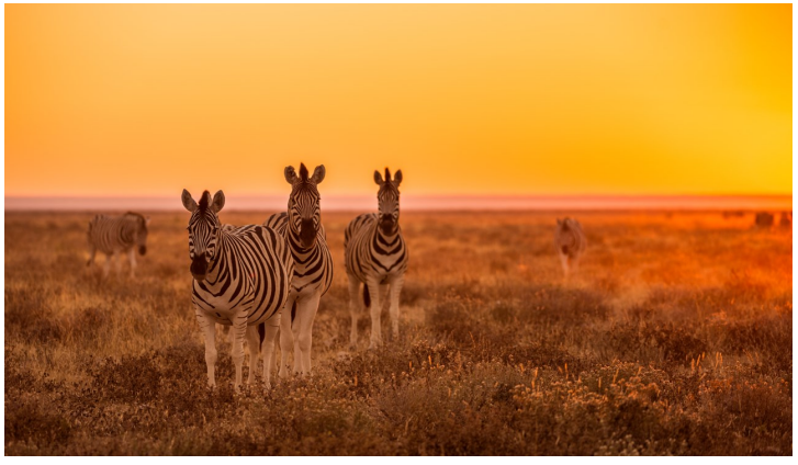
Zebra's grazing in Etosha Park, Namibia