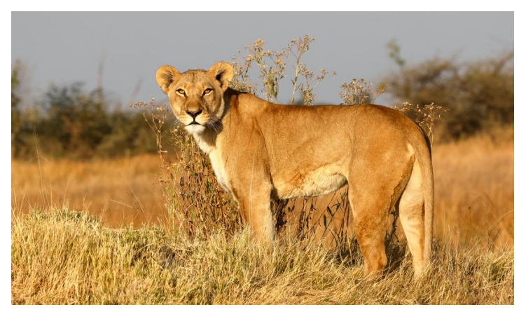
Namibia wildlife is stunning!

This morning, explore some of Africa's finest prehistoric rock art at Twyfelfontein, featuring paintings and engravings dating back 5,000 years. This treasure trove, left by Stone Age artists, is one of the richest collections in Africa. Our journey through this stunning landscape includes opportunities to stretch our legs, examine interesting stones, plants, bugs, and other creatures, and photograph the amazing scenery. Visit the Organ Pipes, a mass of basalt slabs in a ravine carved by a river; Burnt Mountain, a small inselberg and national monument since 1956; and the Petrified Forest, with enormous fossilized tree trunks and welwitschia plants, reputed to live over 1,000 years. This afternoon, we'll search for desert elephant herds on an Aba-Huab River safari.