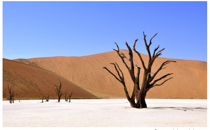
Sossusvlei sand dunes