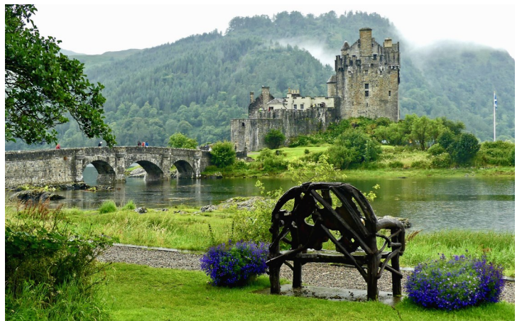
Eilean Donan castle

Take a moment to capture the beauty of Eilean Donan Castle against the stunning backdrop of a picturesque lake