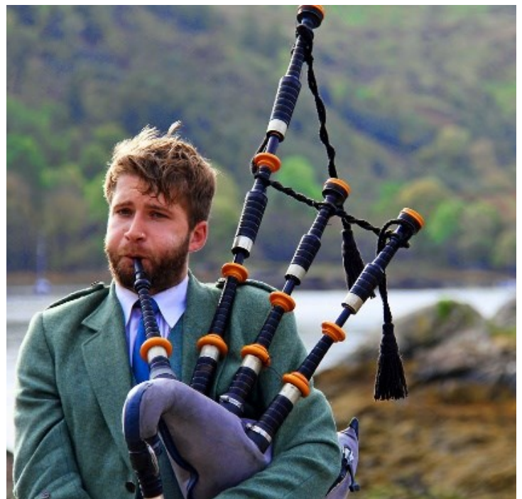
Scottish Highland bagpipes