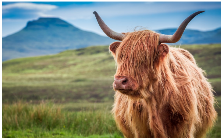
Scottish Highland cow amidst breathtaking scenery