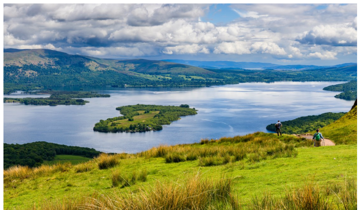
Stunning scenery at Conic Hill and Loch Lomond