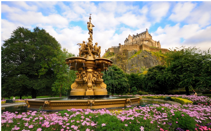
Views of the beautiful Edinburgh Castle

CT Rating 4.5 / 5 - Extremely Challenging: This journey involves hikes on hilly, uneven surfaces, a relatively fast-paced itinerary with a good deal of coach travel and visits to some remote parts of Scotland. Hiking distances, elevation change, and times listed are estimated and refer to the total time spent hiking throughout a full day. Travellers must be in excellent physical condition and able to maintain the group pace. Depending on weather and location conditions, daily activities may have to be altered or adjusted. Accommodations will be in comfortable traditional Scottish hotels with atmosphere and character. Trails and trail conditions may vary and are subject to change . Porters may not be available at all hotels and members should be prepared to move their own luggage when required.