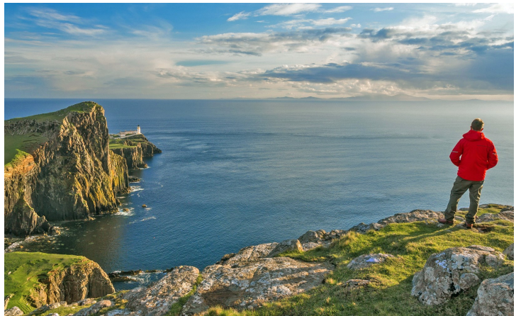
Enjoy majestic views at Neist Point, Isle of Skye