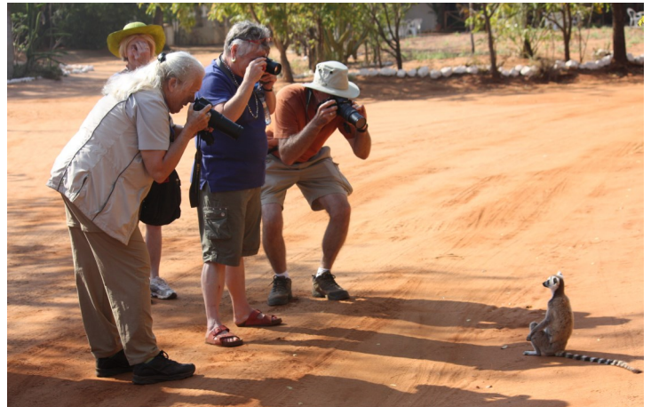
'Say cheeeese!'