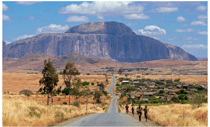
Bishops Hat

In Ambalavao we visit a traditional "Antemoro" papermaking workshop. Continue to Ranomafana National Park, a high-altitude rainforest reserve where the golden