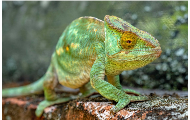
Chameleon