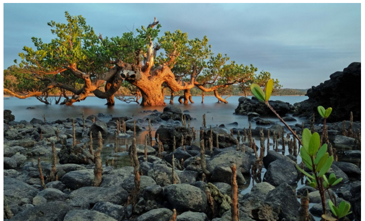
Madagascar mangroves