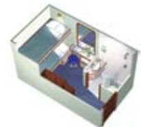
Category 6 (upper/lower berths)